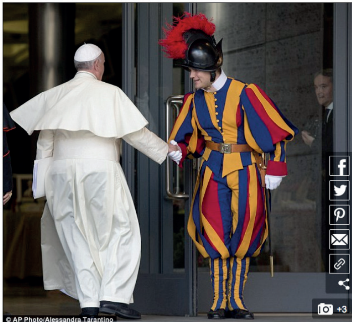
Egg and chips again? A soldier from the Vatican's Swiss Guards shakes hands with Pope Francis

A new cookbook - Bon Appétit, Swiss Guard - reveals the favourite dishes of Pope Francis and his two predecessors, Benedict XVI and John Paul II.